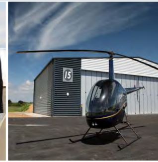
5 new aviation hangars