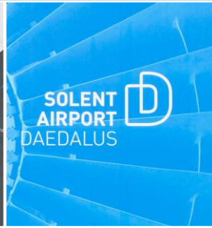
Corporate aviation facilities