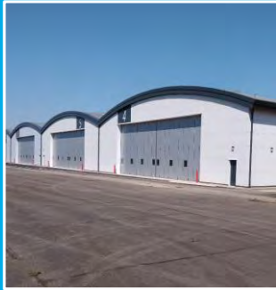
New business hangars