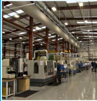
UTP Head Office