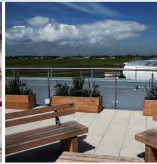
Innovation Centre extension