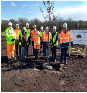
Daedalus Common landscaping