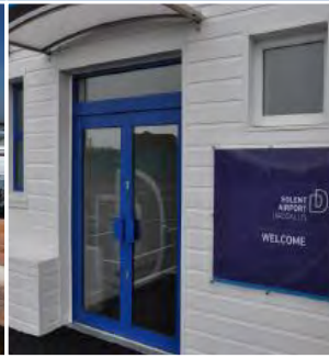
Control Tower refurbishment complete