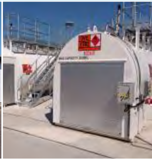
New fuelling facilities