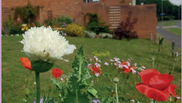
Fareham In Bloom at Vimy House