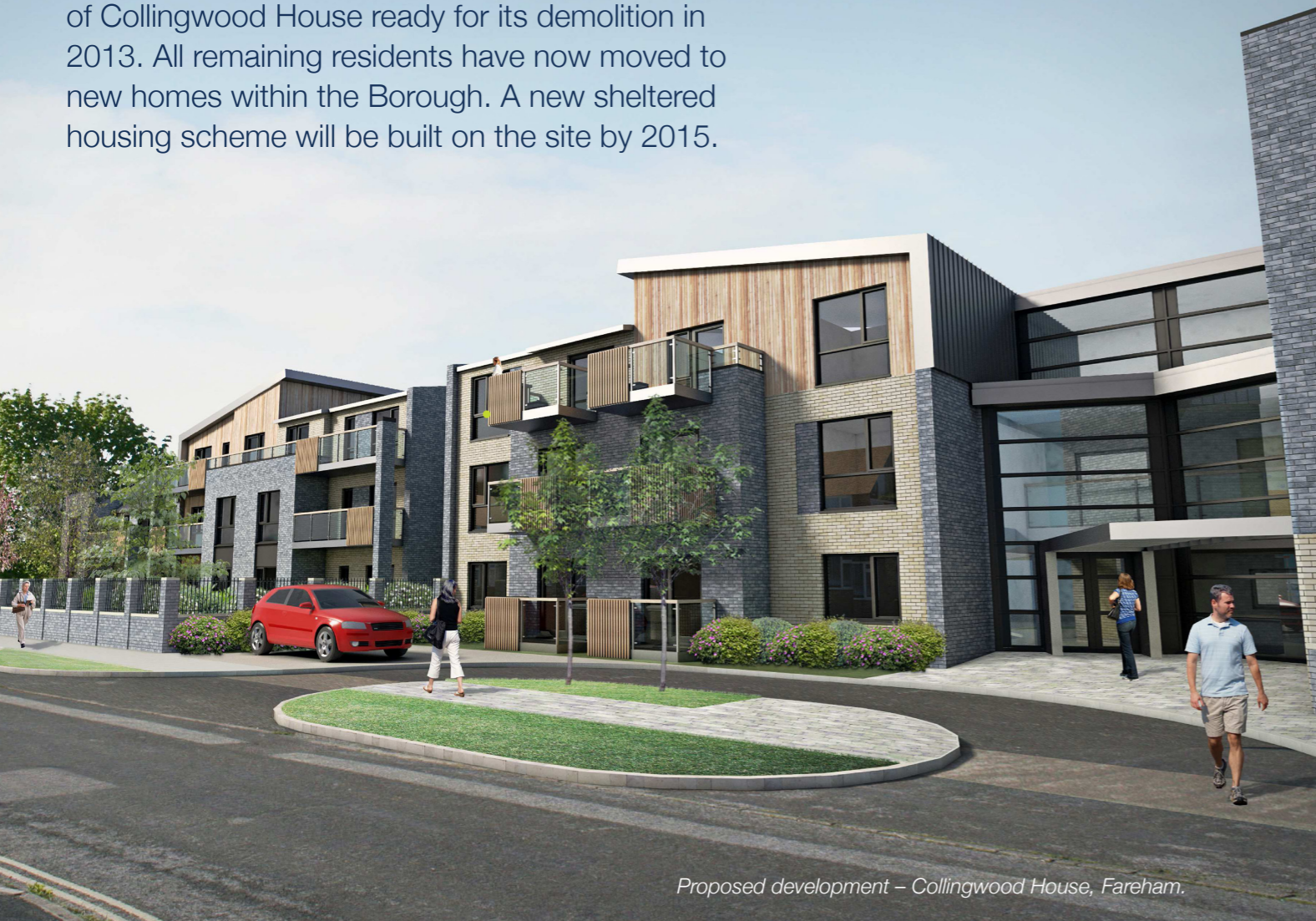
Proposed development – Collingwood House, Fareham.

In July 2012, we started to move residents out of Collingwood House ready for its demolition in 2013. All remaining residents have now moved to new homes within the Borough. A new sheltered housing scheme will be built on the site by 2015.