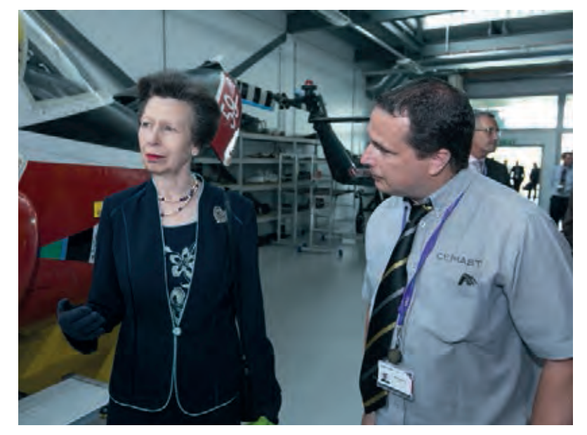
Her Royal Highness visited CEMAST college and spent time talking to students there about their work. Here she was treated to demonstrations in robotic programming, engineering, 3D printing, and a wind tunnel/flight simulator.