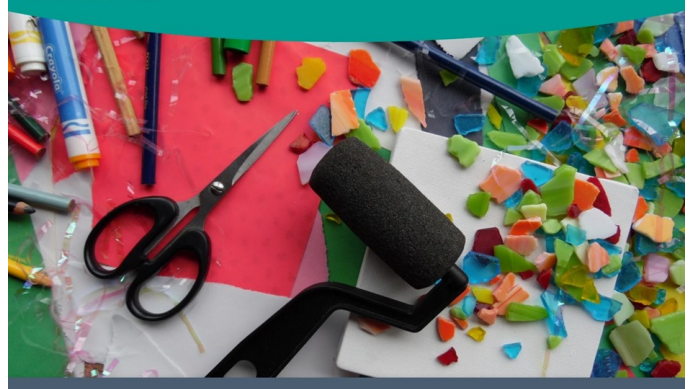
Arts and Crafts Club Try different crafts from pebble painting, collages and card making

This is a weekly club starting on 27 June. Each week, there will be the chance to try out a different art or craft medium. All are welcome!