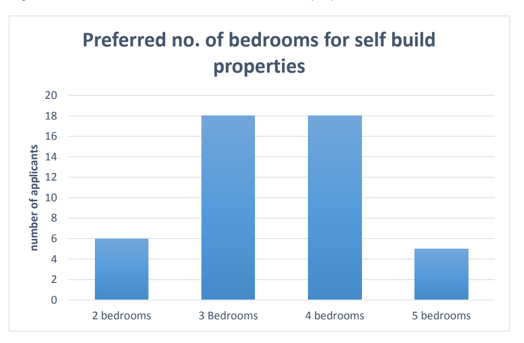
Figure 2 – Preferred no. of bedrooms for self-build properties

4.6 Applicants on the register also supplied information on their preferences for the number of bedrooms for a self or custom build home. The information supplied for Figure 2 is taken from the register for the first base period<sup>6</sup>, and it is noted that applicants have selected more than one preference for the number of bedrooms they would require for their self or custom build home. Figure 2 indicates that the preference is for larger homes with three to four bedrooms, which suggests that there is a need to provide self-build homes for larger families.