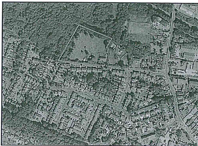
Figure 1. Proposed Site showing context including proximity to local services

The purpose of this letter is to provide additional information to that provided within the emerging Local Plan regarding the deliverability ('availability', 'achievability' and 'suitability') of a residential development on the site. Based on an estimated net developable area comprising 60% of the site and an average net residential density of 40 - 45 dwellings per hectare (dph) the site is considered to be capable of delivering c.30 - 35 dwellings, with associated open space, landscaping and highway access.