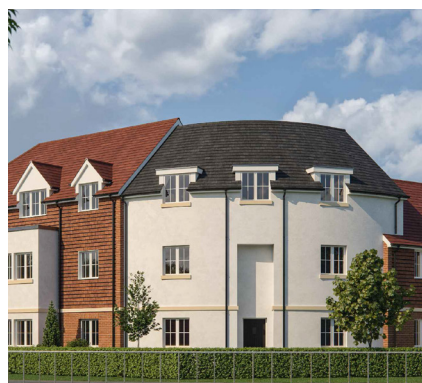
Artist impression of Station Road