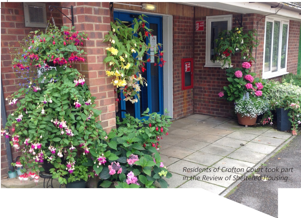
Residents of Crofton Court took part in the Review of Sheltered Housing