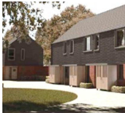
Artist impression of development at Oak Tree Close, Park Gate

The Council have also recently confirmed that they will be seeking the redevelopment of Assheton Court in Portchester to provide a modern and larger sheltered housing facility. It is intended that Assheton Court will close when the nearby new sheltered housing development at Station Road is complete, potentially at the end of 2021/early 2022.