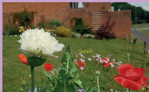
Fareham In Bloom at Vimy House