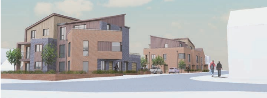
Artist impression of 18 new flats to be built at Highlands Road (former Hampshire Rose pub site).

In addition to tenancy services and the maintenance of Council homes Fareham Housing are also looking ahead to ensure further new affordable homes are provided and built. This will help to address the on-going need for affordable housing in Fareham, particularly for those on our waiting list.