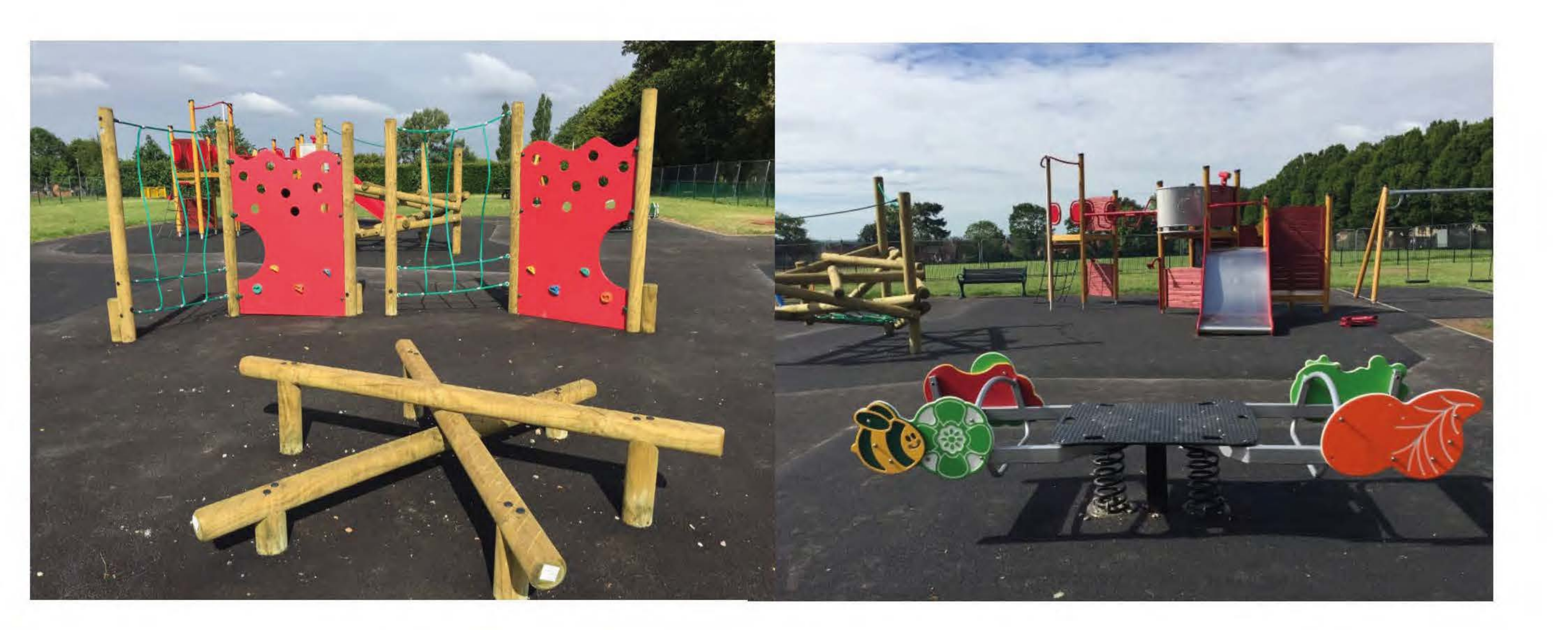
Park Lane's new play area