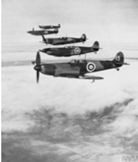
The battle in the skies above Britain 1940