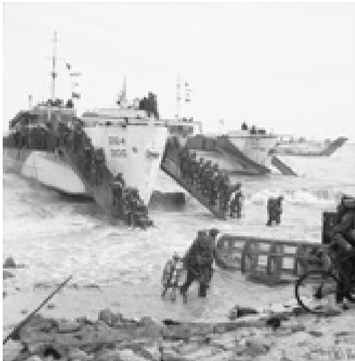
Allied troops land in France 1944