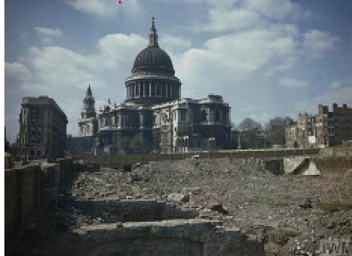
Blitz bombing damage caused to London, 1940–1941