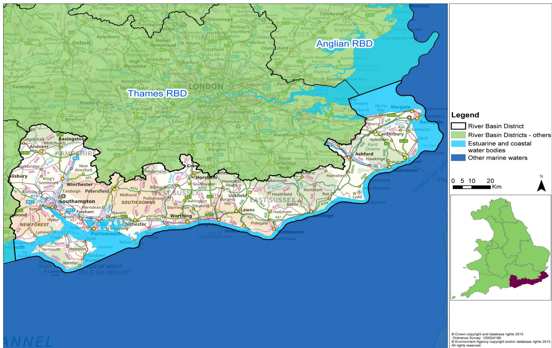
Figure 1: Map of the South East river basin district